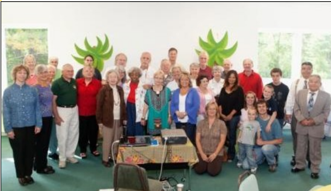
Like last furlough, we wanted to honor our FACE 2 FACE donors and report back to them. We ate, laughed, prayed, and shared how God was reaching into some very dark places and redeeming lives through their partnership with us. Wish we could have invited those of you outside of Ohio.