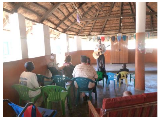
Left: ACTION Gulu missionary team and Home of Love friends celebrating Jesus on Christmas. Above: our Christmas worship service.