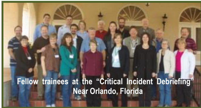
Fellow trainees at the "Critical Incident Debriefing" Near Orlando, Florida

Then we "flew" into 2011 with a trip to Florida for training in "Critical Incident Debriefing." We will use this training to better serve our fellow missionaries scattered in over 25 countries.