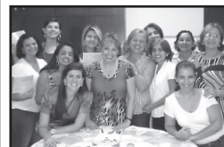
Ladies trained as leaders by Iria Braun in Brazil