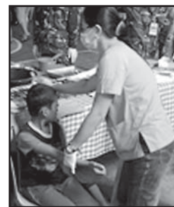
Philippine medical clinics