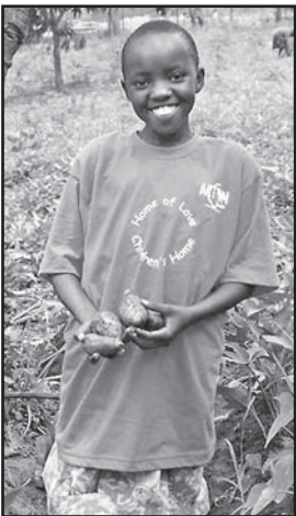
A budding gardener

“The young people love to play in the dirt as they learn about the various crops. The children recently helped harvest our crop of sweet potatoes. They were especially excited about this project because sweet potatoes are one of their favorite vegetables. They think the best part about planting seeds and learning how to take care of the plants is getting to eat the results!”