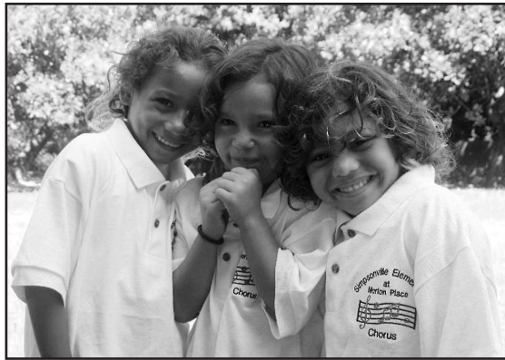
Three of the Girls at Davis Lar