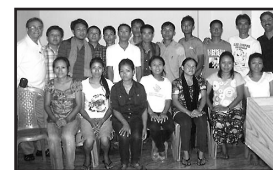
Training Farmers in India