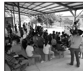
Timothy House VBS