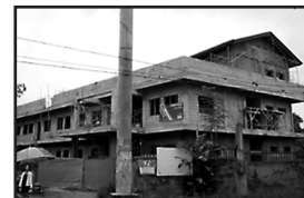
Shalom Birthing Center