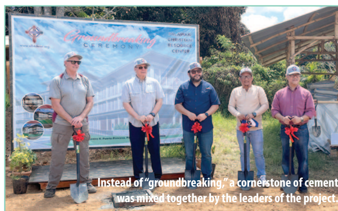
Instead of "groundbreaking," a cornerstone of cement was mixed together by the leaders of the project.

ACTION Philippine's decades-long desire has been to come alongside local churches to help them identify, equip, send and care for their Gospel workers in local and global cross-cultural ministries, particularly among un-