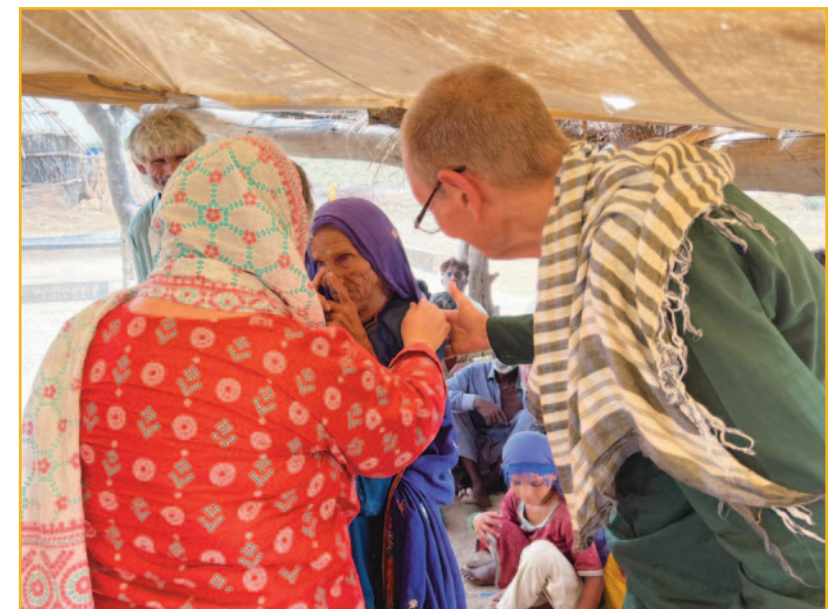
Photo from our trip to South Asia in June 2024

The Global Frontier Missions website states, “[A] tragedy is that many missionaries do not fulfill their commitment to stay on the field. 71% of missionaries leave the field earlier than intended for preventable causes, and many leave after only two years. Close to 50% of missionaries don’t return to the field after their first term.”