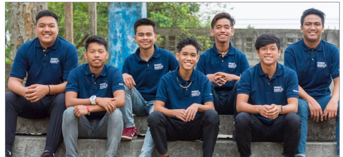
Honest Hands Discipleship Home Disciples

At the Honest Hands, I went through a nine-month program that teaches Bible, Christian values, and personality development. It was a good challenge for me. I experienced growth, I excelled in my studies in computer technology, and ultimately, I graduated from high