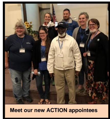
Meet our new ACTION appointees

Our first flight since February 1st was to Seattle to be a part of ACTION's Fall Orientation, where we helped train and welcome in 9 new Global Workers!