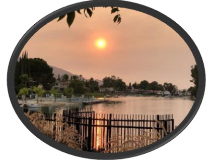
A smoky summer made for beautiful sunsets

This month, we thought we would send you a "pictorial update" of what Has been happening in our lives since we last wrote. Enjoy!