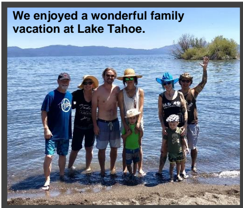
We enjoyed a wonderful family vacation at Lake Tahoe.